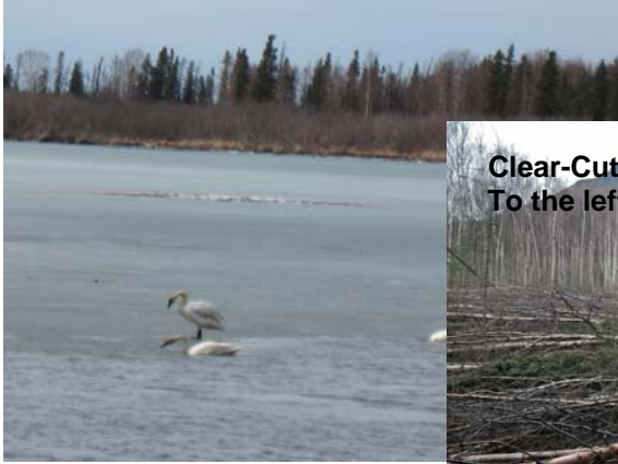
Swans at Jim Lake, April 19, 2009