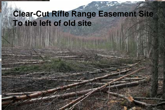
Clear-Cut Rifle Range Easement Site To the left of old site