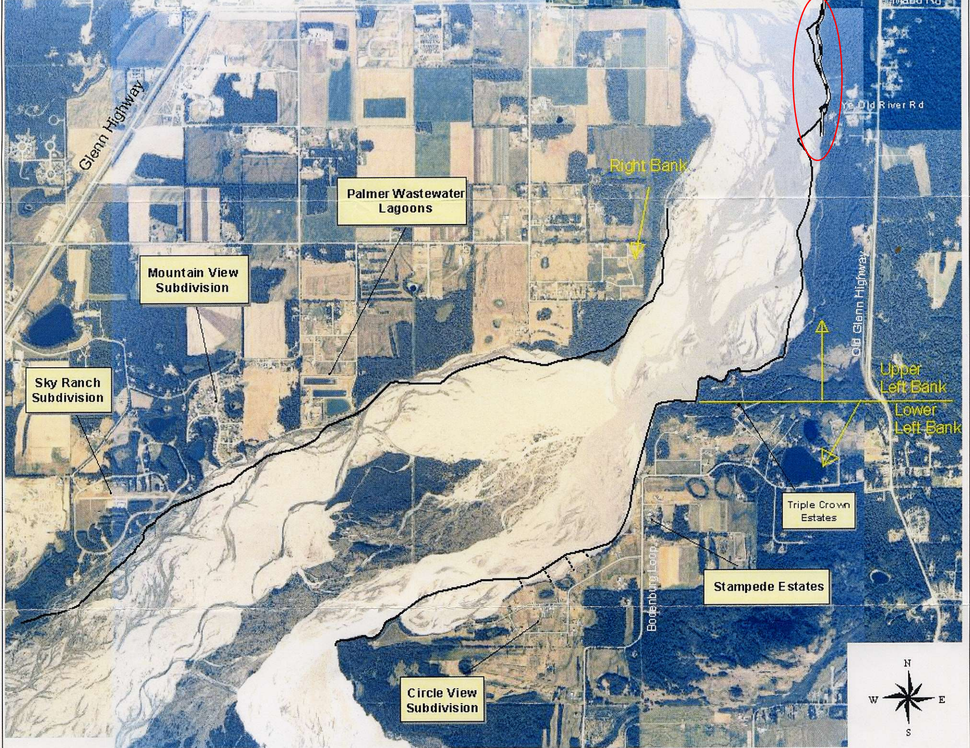
Figure 3. Change in Banklines: 1939-1996 Matanuska River near Palmer, AK

Expedited Reconnaissance Study 905(b) Matanuska River Erosion